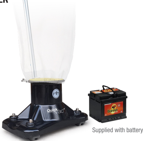
Supplied with battery