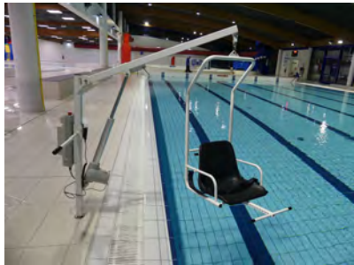
Hard Seat Option